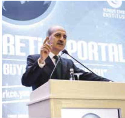
Prof. Dr. Numan Kurtulmuş

After the shares of students, former Minister of Culture and Tourism Prof. Dr. Numan Kurtulmuş primarily evaluated the activities of YEE. Starting his speech with expressing that YEE was an institution representing the Turkey's soft power and its works for expanding and diversifying activities was beyond every kind of appreciation; Former Minister Kurtulmuş said the activities of YEE would increasingly continue. Expressing that one of the most important things that makes human a human is the language; Kurtulmuş "Language is the most important thing granted to humanity. Our language is our pride for that we speak turkish from the hearth. We are the children of a sincere-speaking nation that could meet the language with heart and that developed the