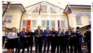
Turkish Culture and Tourism Minister Kurtulmuş has inaugurated a new branch of the Yunus Emre Institute in the Russian capital of Moscow.

There has been widespread interest through Turkey from there an image and consultation that supports our goal. We are a country that is open to the world and we are a country that is proud of its culture and its heritage.